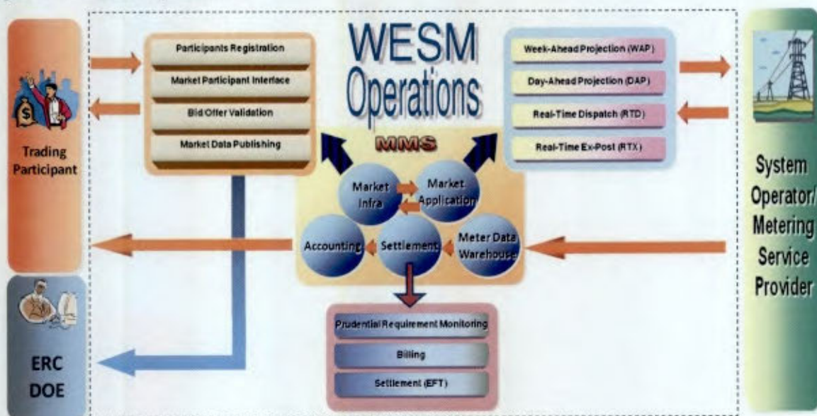
Figure 1. WESM Operations